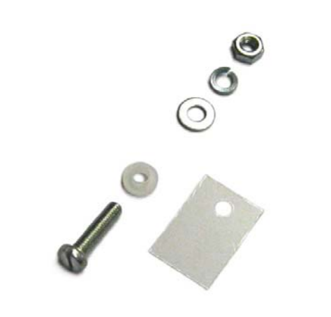
TO-220 INSULATING WASHER