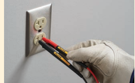
Increase tip exposure for CAT II probing