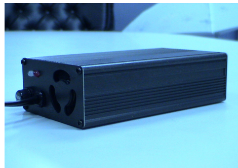
3A ~ 10A Charger