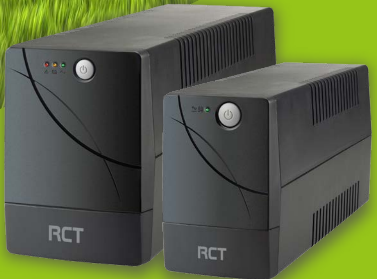
RCT-1000-VAS / RCT-2000-VAS