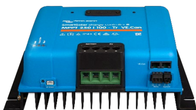
SmartSolar Charge Controller MPPT 250/100-Tr VE.Can without display