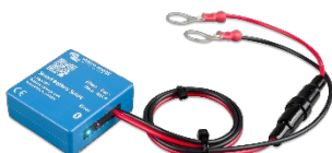
Bluetooth sensing: Smart Battery Sense