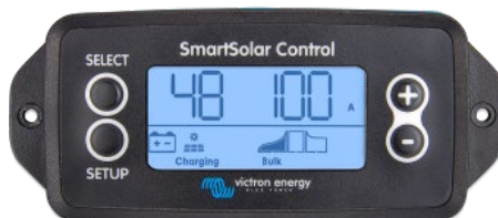
SmartSolar pluggable display

Simply remove the rubber seal that protects the plug on the front of the controller, and plug-in the display.