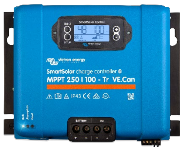
SmartSolar Charge Controller MPPT 250/100-Tr VE.Can with optional pluggable display