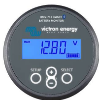
Bluetooth sensing: BMV-712 Smart Battery Monitor