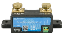
Bluetooth sensing: SmartShunt