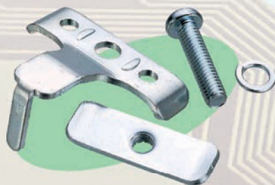
BMC2S-FP for 2S (50Amp) Series BMC2M-FP for 2M (175Amp) Series