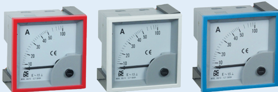
Choice of coloured bezels for Ammeters & Voltmeters