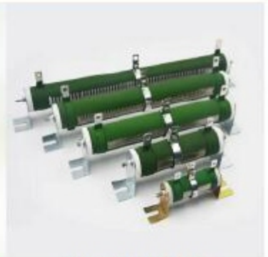
可调型 Adjustable type