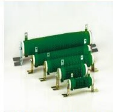
波浪型 Ribbon wirewound resistor