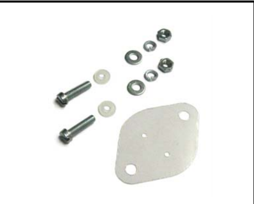
TO-3 INSULATING WASHER